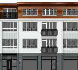
PRINTING PRESS BUILDING Front building Hverfisgata 78