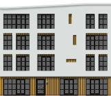
PRINTING PRESS BUILDING Courtyard building Hverfisgata 78