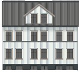
ARTISAN HOUSE Lindargata 11