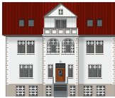
PRIME MINISTER'S RESIDENCE Hverfisgata 21